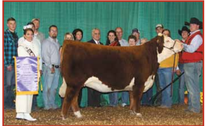
Powerload daughter--Res.Champion 2011 Keystone

EPD'S: BW 3.0 WW 43 YW 67 M 15 M&G 36 FAT -0.015 REA 0.10 MARB -0.06 • Heifer calf, born 10-18-11, sired by AA PRF POWERLOAD. One of the sexiest heifers in the sale. A front pasture cow that surely has a maternal look. We keep saying don't sell any Airwave cows. Our loss is your gain.