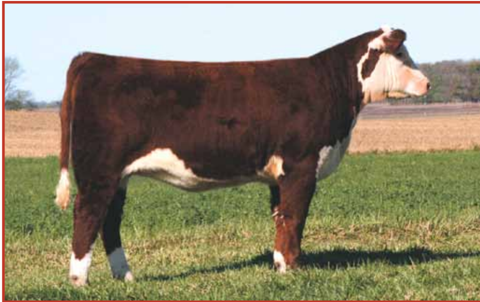
Lot 6--AA Maxine 19

6 AA Maxine 19 Heifer 7 AA Maxine 197 Heifer P43222517 CALVED: JAN 12, 2011 TATTOO: RE-19 P43220698 CALVED: MAR 22, 2011 TATTOO: RE-197