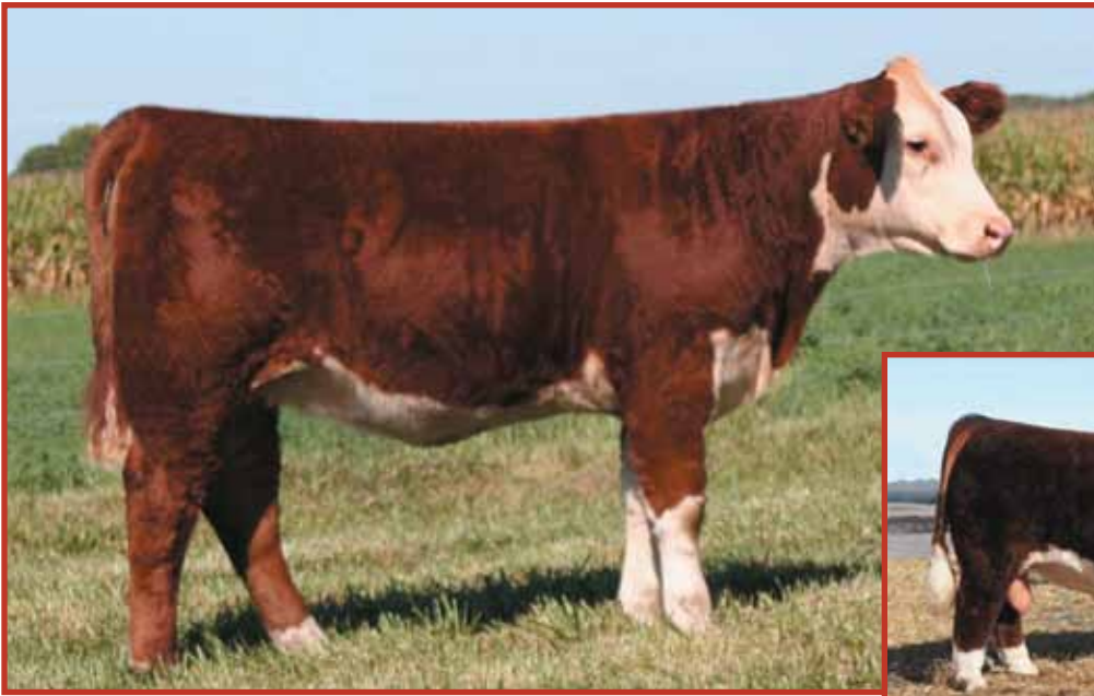
Lot 23--AA Exclusive Gal 120