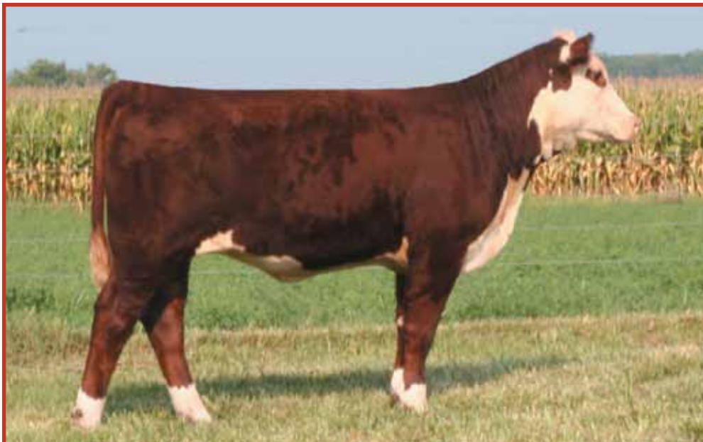
Lot 9--AA Ms Wrangler 116

EPD'S: BW 5.5 WW 58 YW 92 M 23 M&G 51 FAT -0.012 REA 0.49 MARB -0.03 • Probably the longest spined heifer selling. Straight legged, level topped, neck comes out top of shoulder. Red eyes.