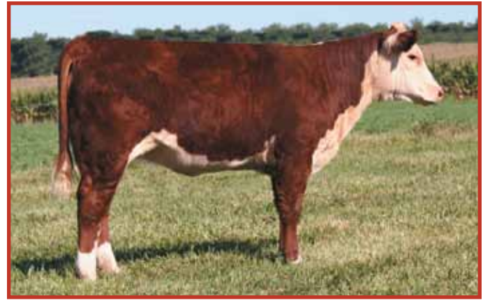
Lot 20--AA LCC Awesome Gal 147

EPD'S: BW 1.5 WW 47 YW 68 M 16 M&G 40 FAT 0.024 REA 0.09 MARB 0.18 • Dam is one of the most consistent money making cows on the farm. She has produced more than one sale topping animals. Surely a foundation herd builder