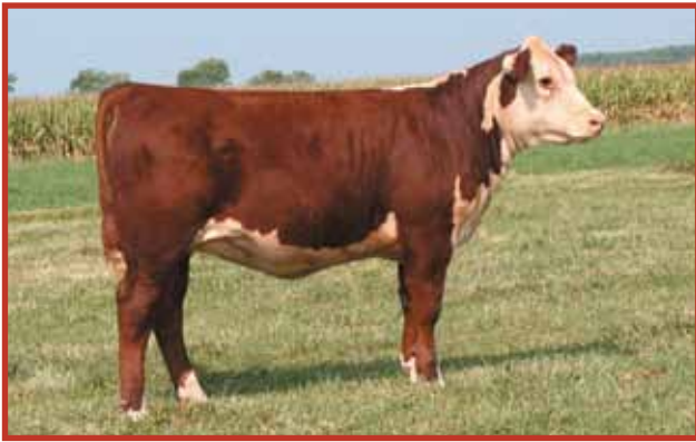
Lot 40A--AA Molly 142

EPD'S: BW 2.9 WW 42 YW 73 M 23 M&G 43 FAT -0.007 REA 0.34 MARB 0.00 • Steer calf-TT#179-3/3/11 by TH 16G Chill Factor 77N. Bred AI on 3/28/11 to THM Durango 4037. Safe to AI date. Pasture exposed to AA HRD LF Airline 820. A daughter of the National Champion Reload and one of our favorite cow families. A cow with nearly ideal body conformation that weaned off one of our heaviest calves. Cow is the maternal sister to AA Airline 972 ET.