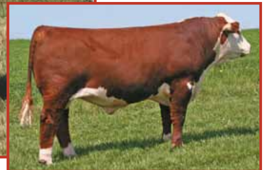
CRR 63N Tundra 865