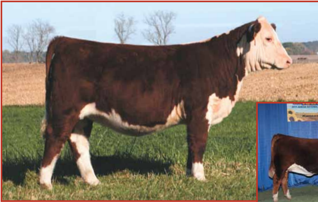
Lot 27A--AA HRD Cecilia 170