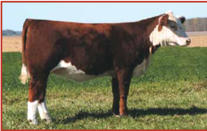
Lot 21--AA Adaline 1101

EPD'S: BW 4.2 WW 58 YW 92 M 25 M&G 54 FAT 0.012 REA 0.32 MARB 0.10 • By 2 time National Champion, Shock & Awe. So correct in her structure it is scary. Owned with Lowderman.