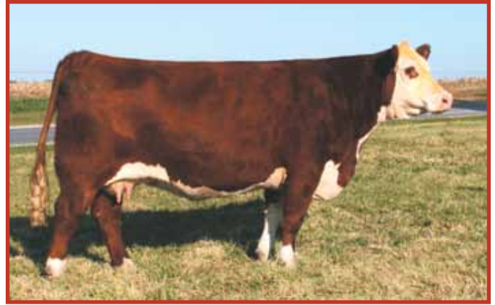
Lot 39--AA Ms Airwave 601

EPD'S: BW 3.2 WW 46 YW 70 M 16 M&G 39 FAT 0.065 REA 0.11 MARB 0.07 • Pasture exposed to AA HRD LF Airline 820 from 3/25/11 to 9/2/11. A cow that got stunted in her growth at and early age. Combine the popularity of her heifer calf and she is still one to own.