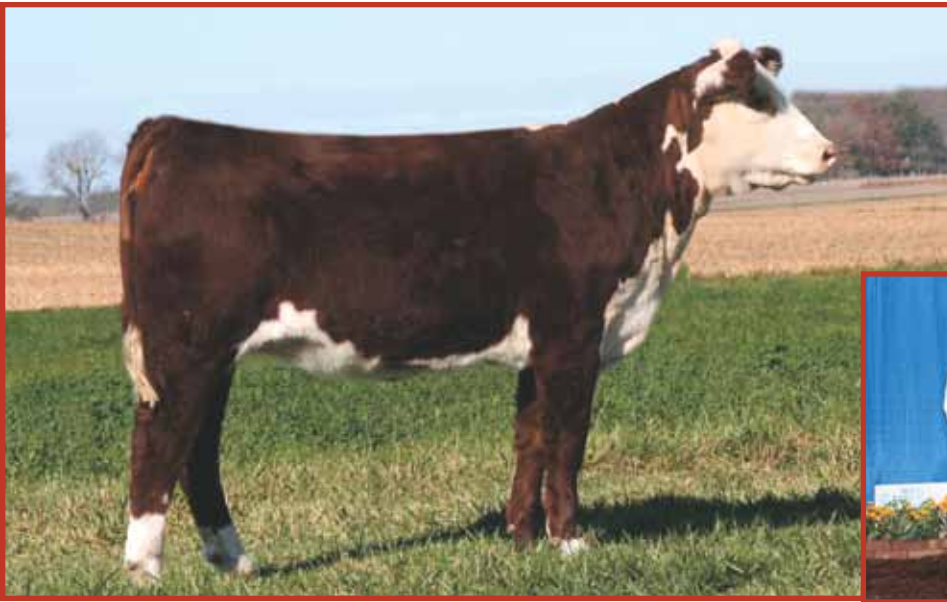
Lot 8--AA HRD Ms TBone 1108