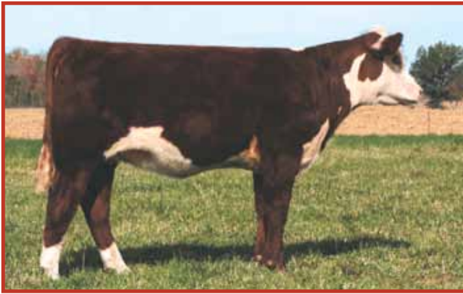
Lot 34A--AA Marlene 194

34A AA Marlene 194 Heifer P43222598 CALVED: MAR 17, 2011 TATTOO: RE-194