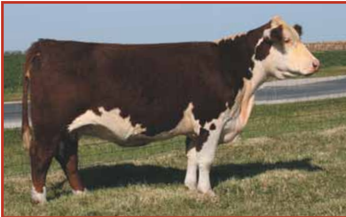
Lot 33--AA Ms Boomer 7152

EPD'S: BW 3.2 WW 46 YW 75 M 23 M&G 46 FAT -0.020 REA 0.60 MARB 0.05 • Freckle faced, straight lined, nicely balanced. She is easy moving and moderate framed. Lots of prominent bloodlines in her pedigree.