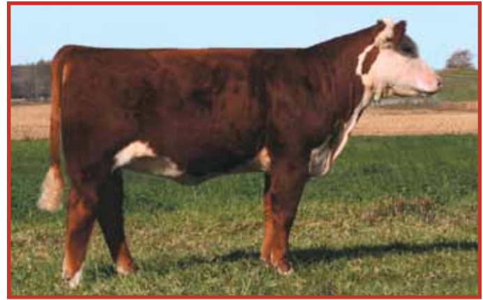
Lot 35A--AA Arlene 16

THM DURANGO 4037 CS BOOMER 29F AA DESTINY 9127 THM 7085 VICTRA 9036 P43063053 AA LF MS TRADITION 402 BAR JZ TRADITION 434V AA TE BASIC LADY 953 LAGRAND MOLER 86S ET BR MOLER ET AA MOLLY 988 JJD VICTORIA GOLD 2018 P43025207 AA DP MS DREAMER 687 AA NBD PROTOTYPE AA DREAM WEAVER 1128 EPD'S: BW 2.4 WW 47 YW 73 M 22 M&G 45 FAT -0.019 REA 0.38 MARB 0.06 • Top prospect bred for calving ease and milking ability.