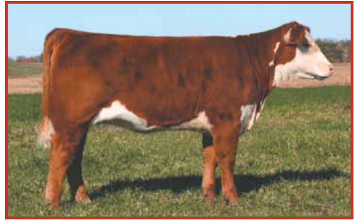
Lot 13--AA Ms Trendsetter 141

AA PRF WIDELOAD AA BBOOMER 611 AA MOTHER LOAD 6168 PRF MS SCARLETT 919 P42768265 AA LADY STANDARD 3161 AA RAMSEY CLASSIC DESIGN GG MS STANDARD 026 EPD'S: BW 2.4 WW 48 YW 74 M 26 M&G 50 FAT 0.023 REA 0.13 MARB 0.11 • Heifer calf-TT#1150-9/3/11 by AA HRD LF Airline 820. Pasture exposed to our new herd sire PR 144U Bailout 0005. A deep bodied, square hipped, level uddered first calf heifer with a fall show prospect at side.