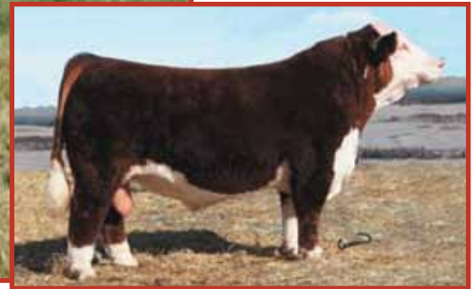
AA Airline 972 ET

23 AA Exclusive Gal 120 Heifer P43222532 CALVED: JAN 22, 2011 TATTOO: RE-120