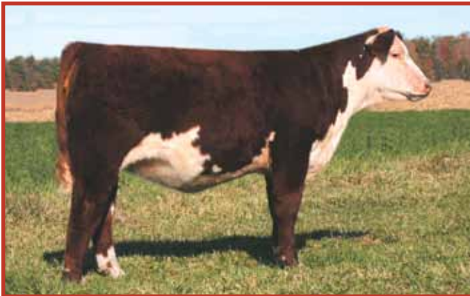
Lot 33A--AA Molly 143

EPD'S: BW 4.7 WW 51 YW 84 M 19 M&G 44 FAT 0.004 REA 0.43 MARB 0.08 • Bred AI 4/2/11 to STAR TCF Shock & Awe 158W. Safe to AI date. Pasture exposed to AA HRD LF Airline 820 from 4/20/11 to 9/2/11, Definitely one of our most consistent producers or we wouldn't have used our last Shock & Awe semen for next year's calf.