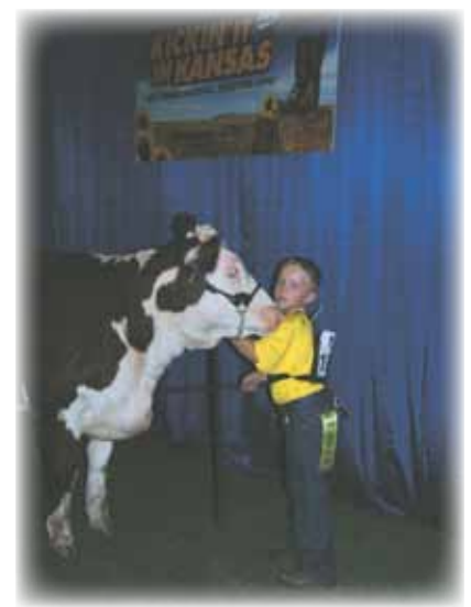
AA HRD Chuckwagon Ultra Max owned with Cosgray Polled Herefordds and Sturdy Herefordds Half brother to Lots 6, 7 & 31A