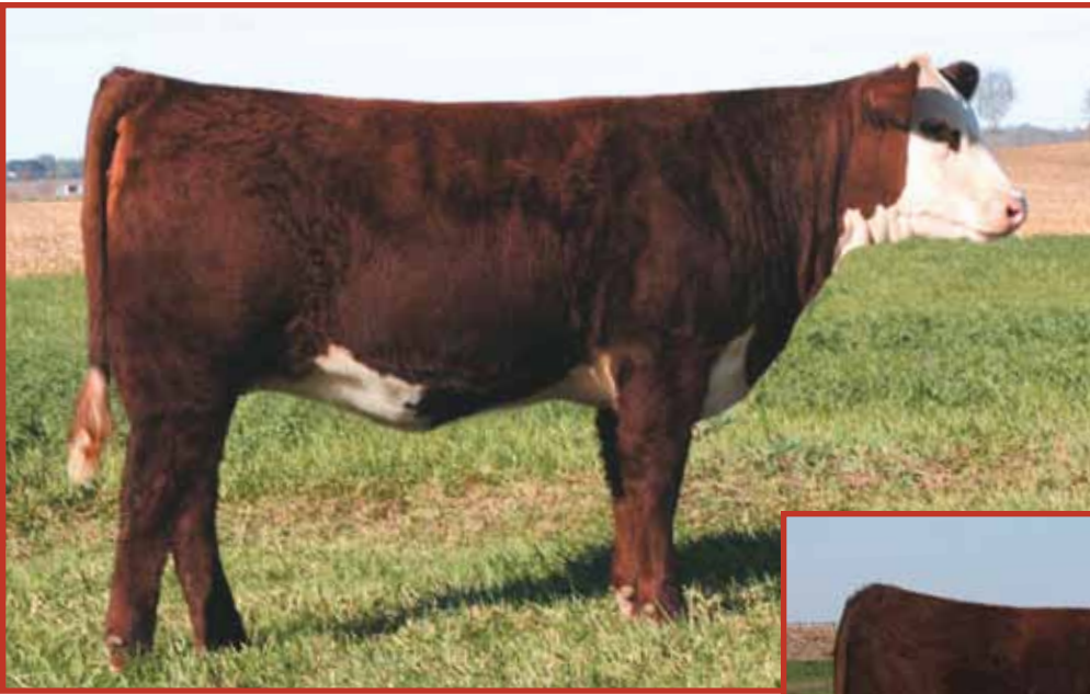
Lot 30A--AA Sho Maxine 159

30A AA Sho Maxine 159 Heifer P43223152 CALVED: FEB 12, 2011 TATTOO: RE-159