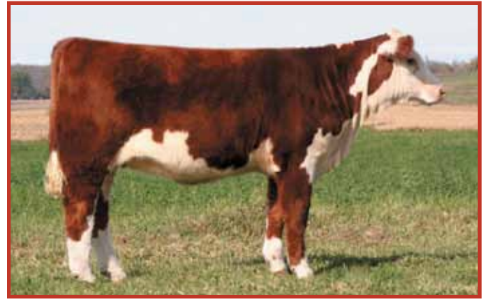
Lot 22--AA Vicky 158

EPD'S: BW 3.8 WW 45 YW 73 M 19 M&G 41 FAT -0.001 REA 0.16 MARB 0.08 • Maybe the highlight of the summer was watching this heifer develop every morning. Long spined, square hiped, slick fronted and sweet faced. A show prospect.