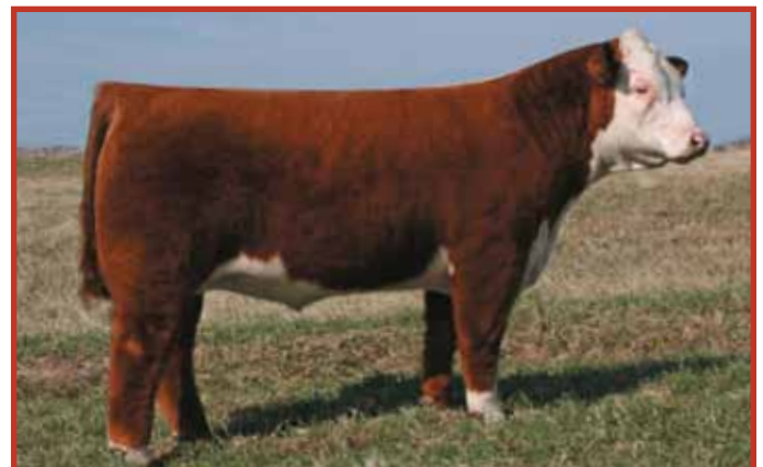
H KH DD Excel 0091 ET