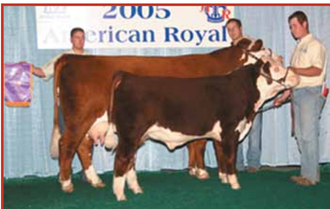
AA Miss Airwave 6119--Dam of Lot 27 Reserve Cow/Calf as a 9 year old at the American Royal

EPD'S: BW 2.5 WW 56 YW 88 M 25 M&G 52 FAT -0.006 REA0.41 MARB 0.07 • Pasture exposed to H KH DD Excel 0091 ET from 7/1/11 to 10/1/11. Power- load's maternal sister. Full sibling to herd sire AA HRD Airline 820 ET. Two of her flush sisters were first and second in class at Denver and one produced a 2011 JNHE class winner.