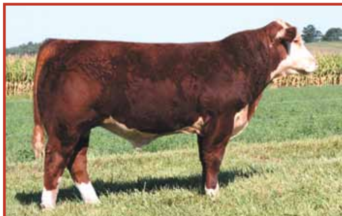
Lot 2--AA Final Drive 131

• Our highest wt/day of age 2011 calf. Soggy bodied, clean fronted, square rumped, straight legged and well bred. A high performing, extra special bull. • Retaining 1/4 interest. • Big Time EPD Numbers! Those milk numbers are for real.