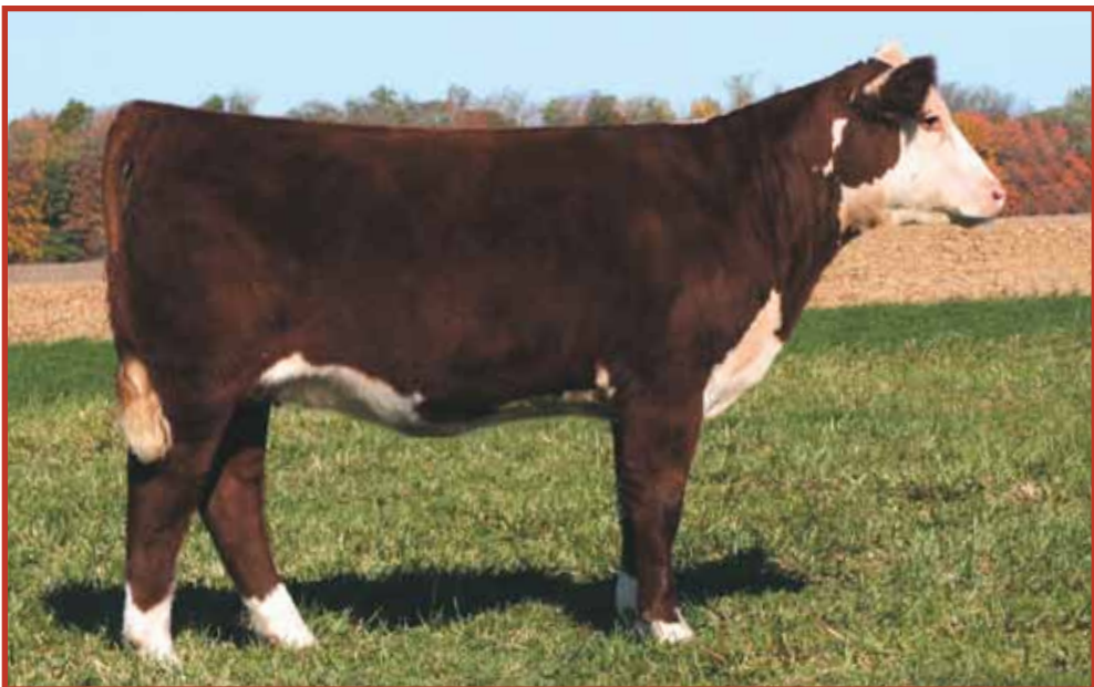
Lot 7--AA Maxine 197

EPD'S: BW 2.6 WW 54 YW 82 M 19 M&G 45 FAT -0.015 REA 0.49 MARB 0.15 • A cool fronted, fashionable female with enough body shape to be show competitive.