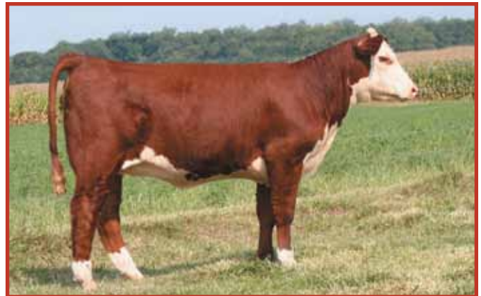
Lot 31A--AA Maxine 140

REMITALL BOOMER 46B REMITALL KEYNOTE 20X AA BDV MS BOOMER 615 REMITALL SALLYS LASS 120X P23904768 AA MISS DOMINETTE 916 AA HIGH CALIBER 205 AA R MS IMPRESSIVE EPD'S: BW 4.6 WW 43 YW 78 M 22 M&G 44 FAT -0.017 REA 0.75 MARB -0.07 • Pasture exposed to AA HRD Airline 820 from 4/1/11 to 9/5/11. 007 is noted for siring fancy, functional females with nice udders. This cow is no exception. Owned with Sturdy Herefords.