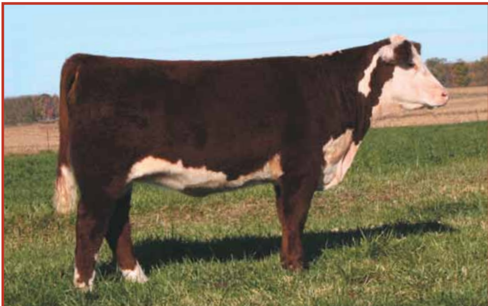
Lot 18--AA Cool Lady 154

EPD'S: BW 5.5 WW 52 YW 86 M 20 M&G 46 FAT 0.012 REA 0.50 MARB 0.07 • The combination of Boulder 28U, P606 and Online.