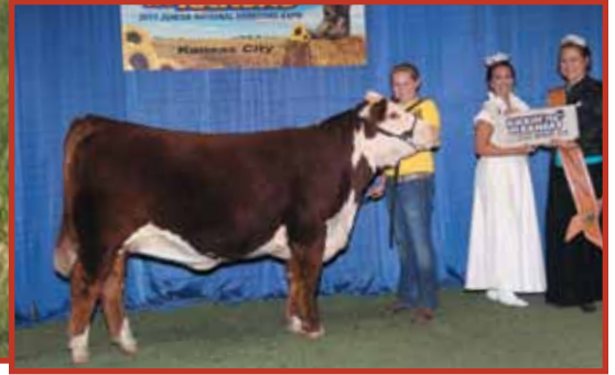
AA HRD Ms Online 078 Daughter of a full sister to Lot 27

27A AA HRD Cecilia 170 Heifer P43223077 CALVED: FEB 22, 2011 TATTOO: RE170