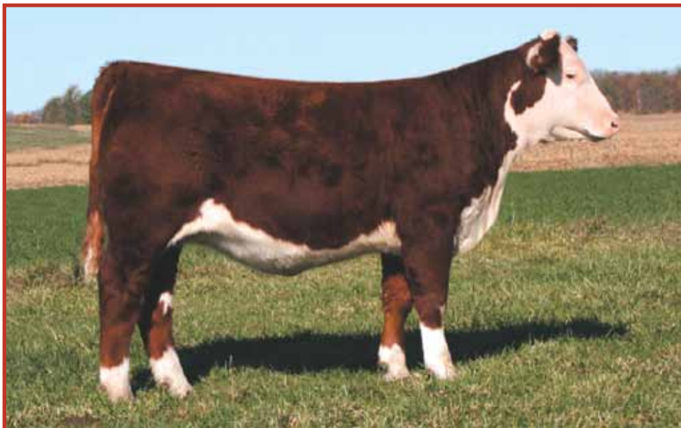
Lot 11--AA Ms Raftsman 124

REMITALL BOOMER 46B EF IDEALIST PENNY 812 GK EXCELLO 116B GG MS STANDARD 026