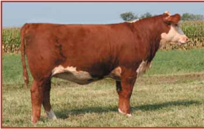
Lot 19--AA Fee Lay 15