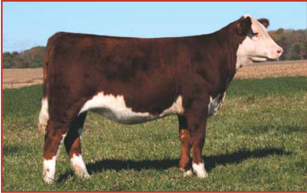
Lot 17--AA Chill Lady 193