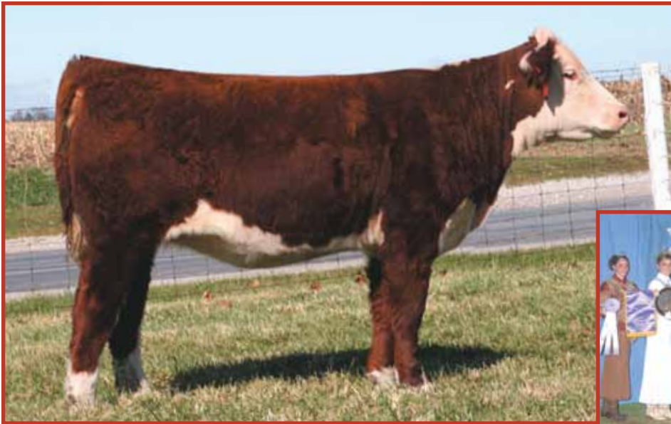
Lot 10--AA DP Ms Raftsman 136