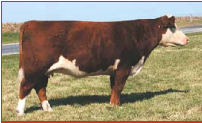
Lot 32--AA Reload Lady 733

EPD'S: BW 3.2 WW 50 YW 81 M 23 M&G 48 FAT -0.012 ARE 0.59 MARB 0.08 • We took 2 of the thicker bulls in the breed in this combination and the result is very pleasing to the eye.