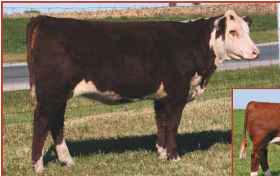
Lot 24--AA Evelyn 164

EPD'S: BW 3.6 WW 44 YW 70 M 15 M&G 37 FAT -0.008 REA 0.19 MARB -0.03 • Dam is old, old. Only the bad ones die young.