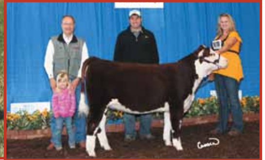
Transplant sister to 1108 who was Division Champion at the 2011 World Beef Expo for Brancel's

8 AA HRD Ms TBone 1108 ET Heifer P43223081 CALVED: APR 12, 2011 TATTOO: RE-1108