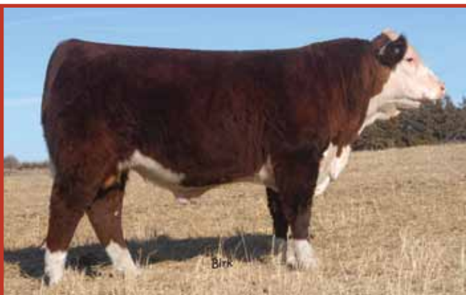
SHF Ultra Max R117 U71

EPD'S: BW 4.3 WW 58 YW 90 M 28 M&G 57 FAT 0.007 REA 0.18 MARB 0.08 • Bred to HKH DD Excel 0091 ET on 5/18/11. Safe to AI date. Pasture exposed to SHF Ultra Max R1117 from 6/7/11 to 9/28/11. A different pedigree that could work in any herd. Her name says it all.