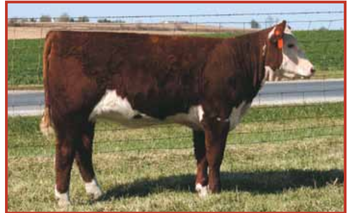
Lot 16--AA Maxine 153

MSU WNH FELTON 5F FELTONS 517 AA FELICIA 1123 WNH MS OPTIMA 9401 P42222645 AA TSF SERENA 753 DUNWALKE DP SETH 509E AA TSF MS PRECISE 510 EPD'S: BW 1.4 WW 41 YW 65 M 13 M&G 33 FAT -0.036 REA 0.28 MARB 0.15 • Yellow colored, new breeding. Deep and Square.