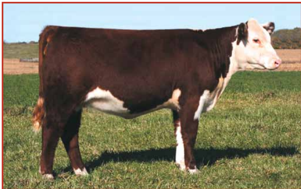
Lot 5--AA Arlene 148

AA PRF WIDELOAD TSF MS KEYNOTE 729 REMITALL GOVERNOR 236G AA WRANGLERETTE 820