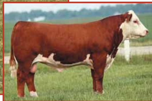
Lagrand Moler 86S ET