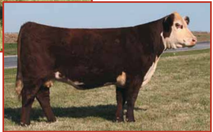
Lot 30--AA 007 Dream Weaver 526

AA WRANGLER 305 NJW 1Y WRANGLER 19D AA WRANGLERETTE 6160 AA TSF MS PRECISE 510 P42768267 AA MS AIRWAVE 4146 STAR AIRWAVE 237C AA GRASS LASSIE 2143 EPD'S: BW 2.7 WW 48 YW 73 M 13 M&G 36 FAT -0.018 REA 0.40 MARB 0.14 • A typical ultra moderate framed, thick made, razor fronted modern type female.