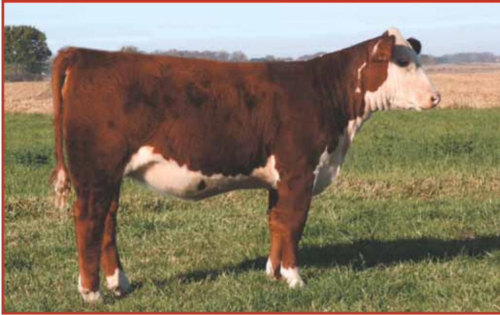
Lot 4--AA JW Fancy Lady 190

4 AA JW Fancy Lady 190 Heifer PENDING CALVED: MAR 10, 2011 TATTOO: RE-190