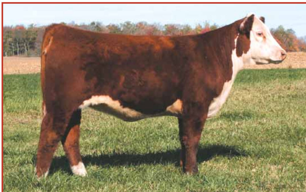
Lot 26--AA PRF Molly 178