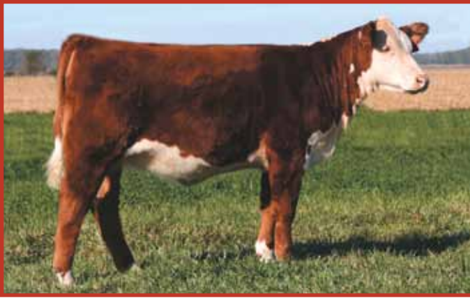
Lot 28A--AA Arlene 1107

28A AA Arlene 1107 Heifer P43222563 CALVED: APR 11, 2011 TATTOO: RE-1107