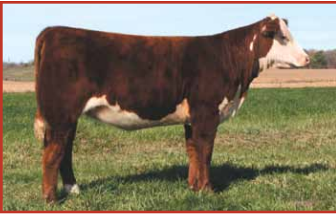
Lot 12--AA DP Chill Lady 168

12 AA DP Chill Lady 168 Heifer P43222555 TWIN CALVED: FEB 21, 2011 TATTOO: RE-168