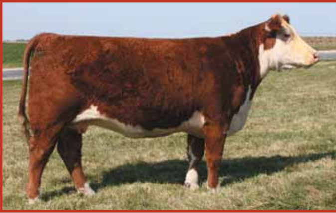
Lot 38--AA Reload Lady 6136

38 AA Reload Lady 6136 Cow 42778992 CALVED: JUN 2, 2006 TATTOO: RE-6136