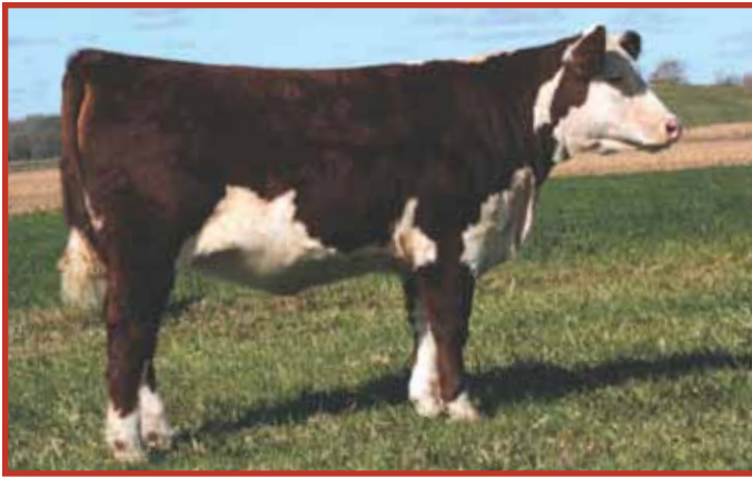
Lot 32A--AA Molly 152