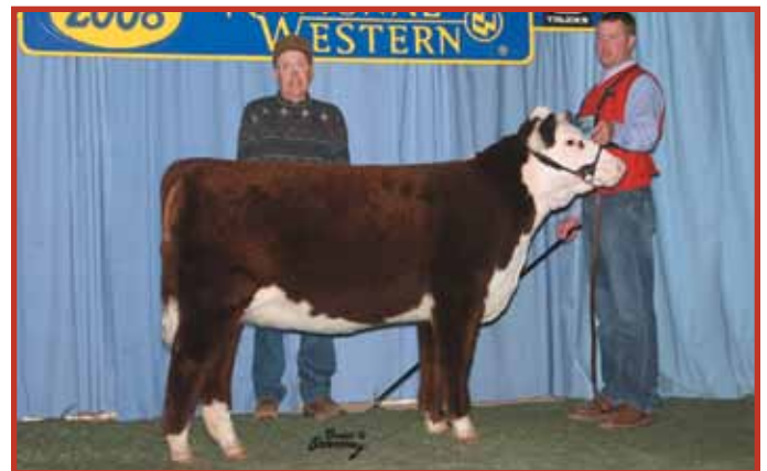
AA HRD Lady Online 7132--Full sister to Lot 27 2008 Denver and JNHE Class Winner