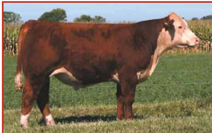
Lot 1--AA Final Drive 129

• Sired by the Kansas City popular champion, Helton, and tracing back to the 6119 cow family. Impressive EPD's. Note the +51 M&G. Nearly ideal in his frame size. Extra nice profiling with lots of muscle expression in all the right places.