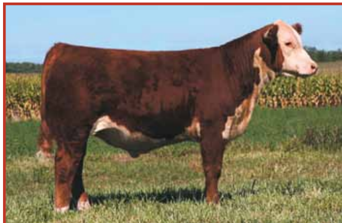
Lot 3--AA Big Top 138

• A unique Rib Eye X Online, high quality, modern designed herd changer. He gets the attention of everyone. A heavy muscled, fault free son of a never miss cow. He is well worth your trip to see. Owned with the Lovelace Family. • Retaining 1/4 interest. • EPD numbers to improve any herd.